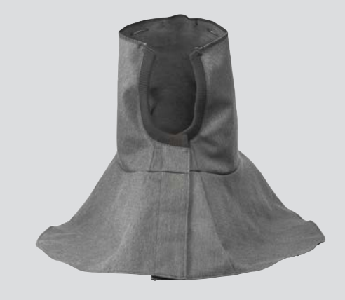
All-new shroud covers front and back of neck and shoulders, as well as upper chest and back. Durable fabric resists sparks, flames and heat.

Heat-reflecting, silver-coated helmet cover helps shed dust and particles so they are less likely to fall onto you when you raise your welding filter.