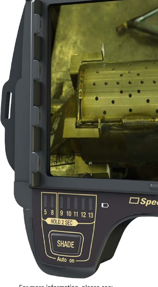
For more information, please see: www.3M.eu/9100XXi